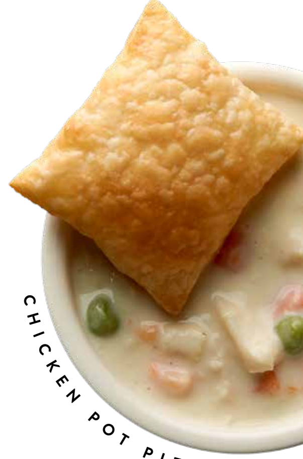
CHICKEN POT PIE SOUP

🌿 Vegetarian 🌾 Denotes Gluten-Sensitive Menu item Jason's Deli is not a gluten-free environment. If you are gluten-sensitive, please request gluten-free preparation when you order. Please be advised that all of our foods are prepared in a common kitchen and that Jason's Deli cannot guarantee that cross-contact with other gluten-containing products will not occur. As a result, we cannot recommend this for persons with Celiac Disease. Our gluten-free offerings are designed for those with gluten sensitivities or those who prefer to avoid gluten for nutritional reasons. Ask for our Gluten-Sensitive Menu.