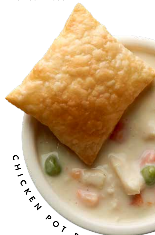
CHICKEN POT PIE SOUP