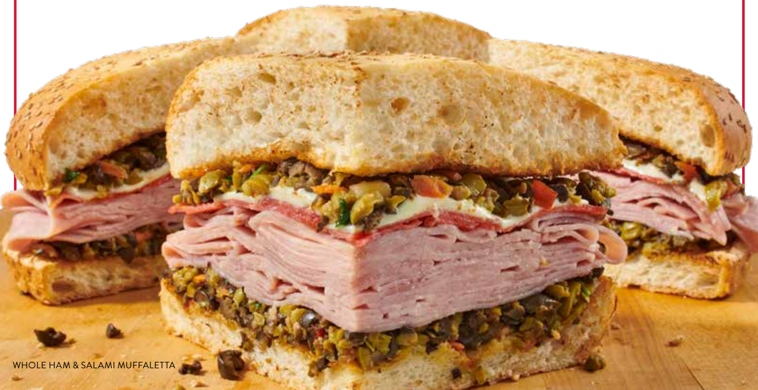
WHOLE HAM & SALAMI MUFFALETTA

WILD SALMON-WICH 540 CAL | 12.89 Marinated wild salmon with guacamole, tomato, lettuce, chipotle aioli, focaccia. One side: fruit, steamed veggies, baked chips or blue corn chips with salsa. (SIDES: 60-250 CAL)